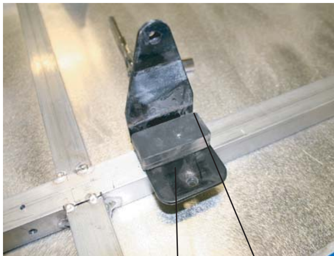
STOCK FRONT MOUNT BRACKET